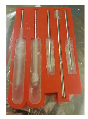
Fig. 2. Inlay arms casting with candle wax

does not give off any fumes was important in the choice. A casting mold was printed and metal rods were used as the arms that would suspend the candle wax part. Figure 2 shows the process. These were placed in 3 support beams that would hold them in place while the silicone was poured.