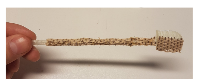
Fig. 4. Mesh placement on the earlier iterations

The entire process turned out to be pretty complicated, and a lot of iterations was made along the way. First attempt was with 5 inlay arms. Figure 2 shows those 5 arms. This setup later showed to be quite unstable, mostly because the walls created, both between them and on the outer part of the tongue, was to thin, and the air would rather expand outwards. Figure 4 shows the setup of mesh around the center inlay in the first iterations. The thought behind this setup was to give a rigid structure in the middle of the tongue, that would not stretch in the forward direction of the tongue. Center inlay was meant to be a tongue tip, that would cause the tip to point upwards. This worked to a certain extent but was later changed to a full sheet of mesh between the top and bottom layers of inlays.