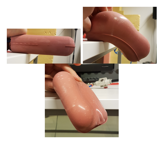
Fig. 7. Pictures of Iteration 4. Top left shows 0 bar pressure, top right shows approx 1 bar pressure, and bottom picture shows what rotation that was achieved from 1 bar pressure .

Iteration 4: The last iteration was then designed with thicker walls and was also created with candle wax inlays. With experience from earlier projects, 5mm wall thickness seemed like it would be great to get the movement we wanted. As you can see in figure 5, the last cast was noticeably bulkier than the earlier ones, and this was due to the increased wall thickness.