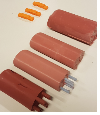
Fig. 5. All the finished casts. The first iteration from the left, until the 4th iteration on the right. Also shows the support beams

Iteration 1: First iteration was made with inlay arms of PVA plastic. The thought was to be able to put the entire muscle in water a couple of days and let the PVA dissolve. An ultrasonic bath was used, and it was left in the bath for 3 days. This proved not to be enough, and there was still very much PVA that was not dissolved after 3 days. The reason why the PVA did not dissolve good enough, was the lack of circulation around the parts. PVA still seems like a good solution if we would be able to guarantee sufficient circulation, either by leaving the tongue submerged for a lot longer time, or design the inlays so that they have an inner tubing that could be used with a pump to circulate the water within the inlay. Iteration 1 was also molded with a top lid, that was designed to keep the inlays in perfect position during the casting process. This lid was later removed since it did not give any improvement over the beam structure we used in later iterations.