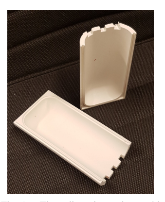
Fig. 1. The split main casting mold

The large casting mold was split into 2 parts so that it would be easier to disassemble after the molding process was completed. It was crafted as a male and a female part, which would fit together tight so that we would not have leakage of silicone during the molding process. This method of creating the main casting mold would also make it easier removing the tongue from the mold after it had cured, compared to earlier iterations where we used a solid mold that needed to be crushed in order to remove the tongue. Figure 1 shows the 2 part casting mold.